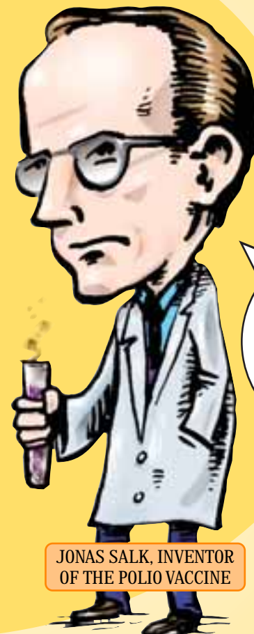
JONAS SALK, INVENTOR OF THE POLIO VACCINE

"WELL, THE PEOPLE, I WOULD SAY. THERE IS NO PATENT. COULD YOU PATENT THE SUN?"