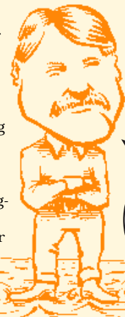
JOHN KITZHABER, FORMER GOVERNOR OF OREGON

In the U.S., we are facing a water crunch as well. Half the population depends on underground aquifers, and for every five gallons we pump out, nature replaces only four. While honoring the history of water rights, we need to adapt to changing times. Markets for water transfers can be designed with social and ecological goals in mind. Our best guide is to recognize that water is, after all, a commons — and to manage it as a "public trust," for the good of everyone.