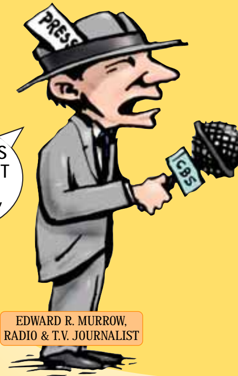
EDWARD R. MURROW, RADIO & T.V. JOURNALIST

"WELL, THE PEOPLE, I WOULD SAY. THERE IS NO PATENT. COULD YOU PATENT THE SUN?"