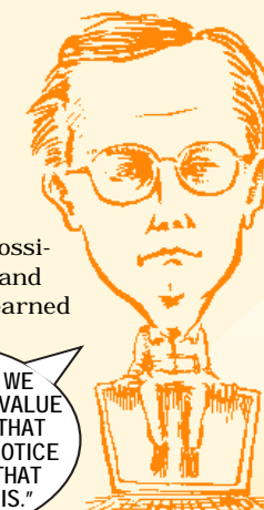
LAWRENCE LESSIG, PROFESSOR AT STANFORD LAW SCHOOL

"SO BLIND ARE WE TO THE POSSIBLE VALUE OF A COMMONS THAT WE DON'T EVEN NOTICE THE COMMONS THAT THE INTERNET IS."