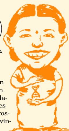
VANDANA SHIVA, PHYSICIST & WRITER

"PATENTS FOR LIVING ORGANISMS IMPOVERISH HUMAN SOCIETY ETHICALLY, ECOLOGICALLY, AND ECONOMICALLY."