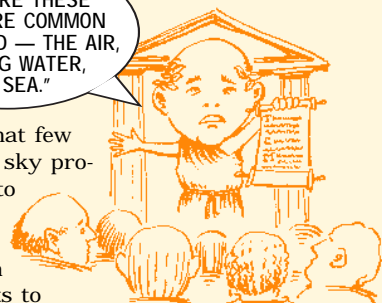
THE INSTITUTES OF JUSTINIAN, 535 CE

"BY THE LAW OF NATURE THESE THINGS ARE COMMON TO MANKIND — THE AIR, RUNNING WATER, THE SEA."