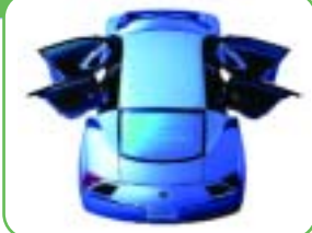
Honda's souped-up prototype, the hybrid Dualnote, packs 400 horsepower and still gets 42 miles per gallon.

Hybrid power can be rugged too. The Army plans to purchase 30,000 hybrid trucks by the end of the decade. And Dodge will introduce a hybrid Ram pick-up that doubles as an electrical generator for running camping equipment or power tools at a remote job site. In case of a blackout, it could even power your home.