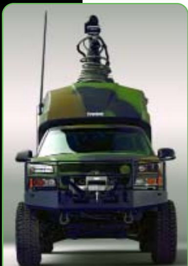
GM's hybrid military Silverado comes equipped with a fuel cell for silent auxiliary power.