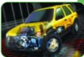
Ford's four-cylinder Escape hybrid SUV matches the performance of the current V6 but delivers 40 miles per gallon.