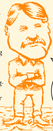
JOHN KITZHABER, FORMER GOVERNOR OF OREGON

In the U.S., we are facing a water crunch as well. Half the population depends on underground aquifers, and for every five gallons we pump out, nature replaces only four. While honoring the history of water rights, we need to adapt to changing times. Markets for water transfers can be designed with social and ecological goals in mind. Our best guide is to recognize that water is, after all, a commons — and to manage it as a "public trust," for the good of everyone.