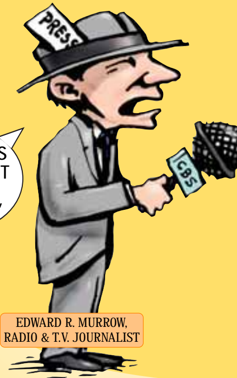
EDWARD R. MURROW, RADIO & T.V. JOURNALIST

"WELL, THE PEOPLE, I WOULD SAY. THERE IS NO PATENT. COULD YOU PATENT THE SUN?"