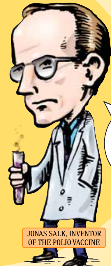
JONAS SALK, INVENTOR OF THE POLIO VACCINE

"WELL, THE PEOPLE, I WOULD SAY. THERE IS NO PATENT. COULD YOU PATENT THE SUN?"