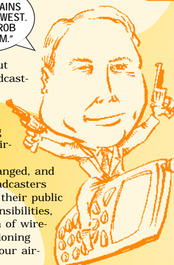
SENATOR JOHN MCCAIN

"THEY USED TO ROB TRAINS IN THE OLD WEST. NOW WE ROB SPECTRUM."