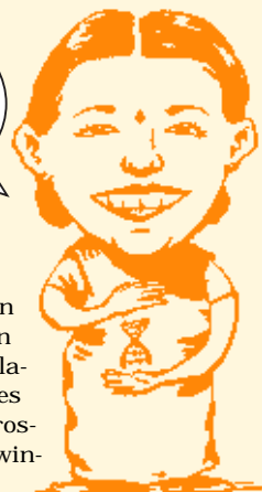
VANDANA SHIVA, PHYSICIST & WRITER

"PATENTS FOR LIVING ORGANISMS IMPOVERISH HUMAN SOCIETY ETHICALLY, ECOLOGICALLY, AND ECONOMICALLY."