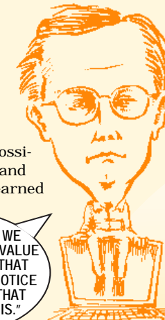
LAWRENCE LESSIG, PROFESSOR AT STANFORD LAW SCHOOL

"SO BLIND ARE WE TO THE POSSIBLE VALUE OF A COMMONS THAT WE DON'T EVEN NOTICE THE COMMONS THAT THE INTERNET IS."