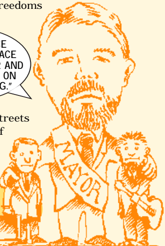
ENRIQUE PENALOSA, FORMER MAYOR OF BOGOTÁ, COLUMBIA

"PUBLIC SPACE IS THE ONLY PLACE WHERE THE POOR AND THE RICH MEET ON EQUAL FOOTING."